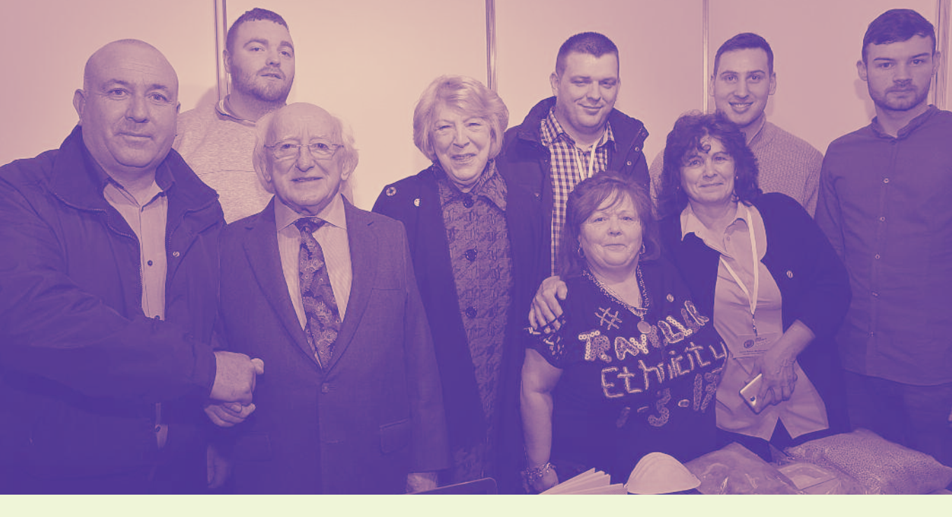
Irish Traveller Ethnicity Celebration, Royal Hospital Kilmainham, March 15th 2018