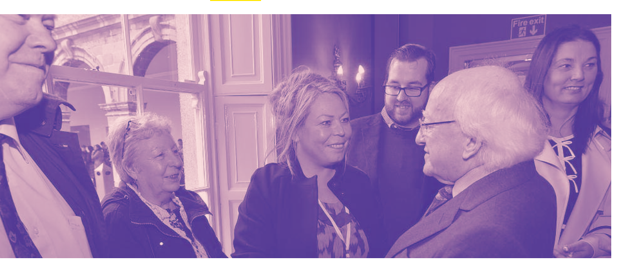
Irish Traveller Ethnicity Celebration, Royal Hospital Kilmainham, March 15th 2018