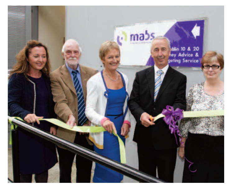
Cutting of ribbon at the opening of the new Ballyfermot MABS Office