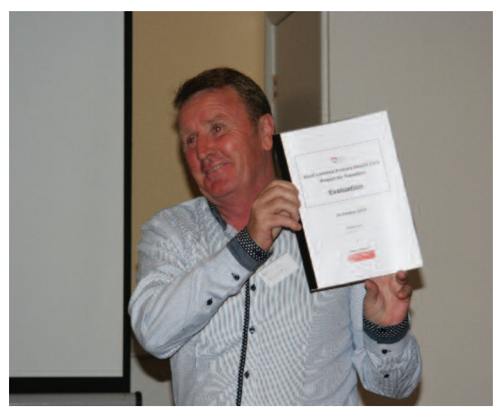
National Traveller MABS were delighted to attend the evaluation of The West Limerick Primary Health Care Project for Travellers.